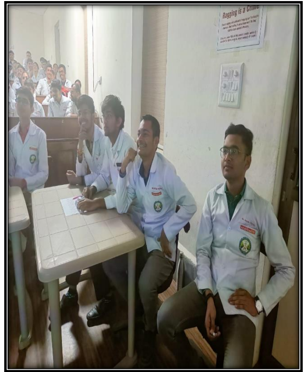
Fig.1 (a). and (b). Library committee team and students during participation in Quiz Competition on 14 th November, 2022